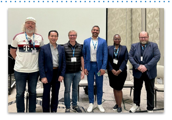
IEEE ICC 2024 Panel