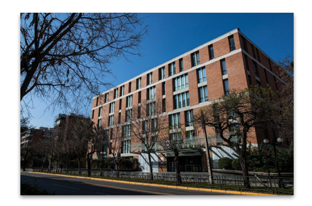
Faculty of Engineering, located in Providencia