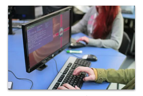
Computer laboratories for 25 people