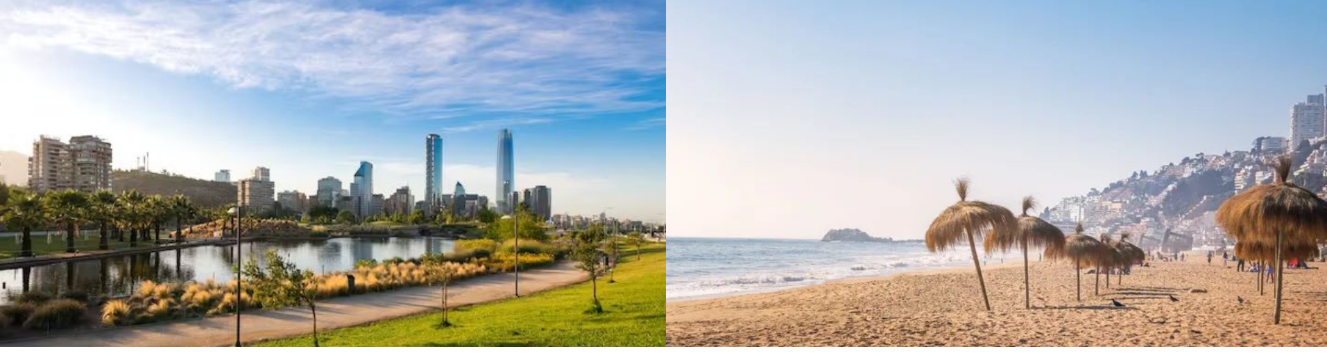
Welcome to Chile! Excellent weather in April 2025