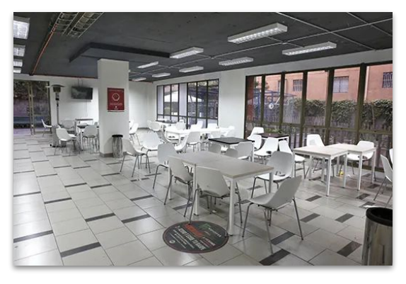
Cafeterias and poster locations