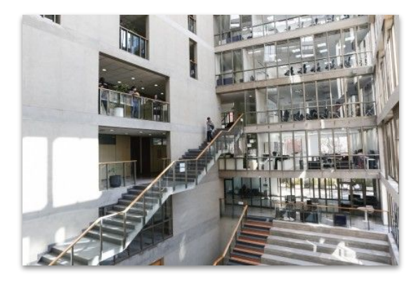
6 floors of teaching, research and I+D