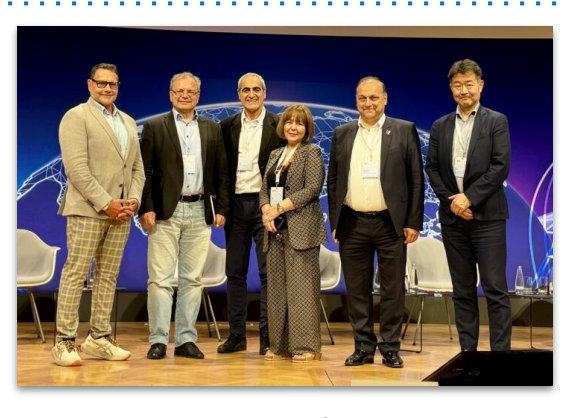
6G Berlin Conference