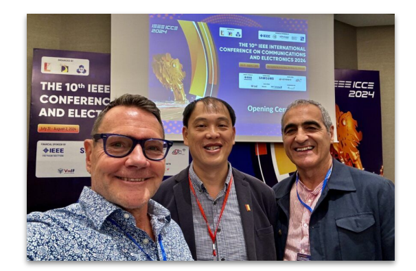
IEEE ICCE 2024