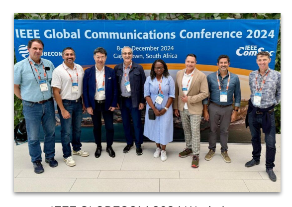
IEEE GLOBECOM 2024 Workshop