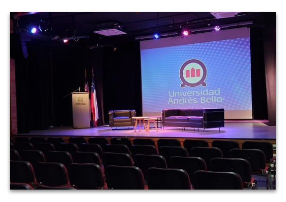
Auditorium for 200 people